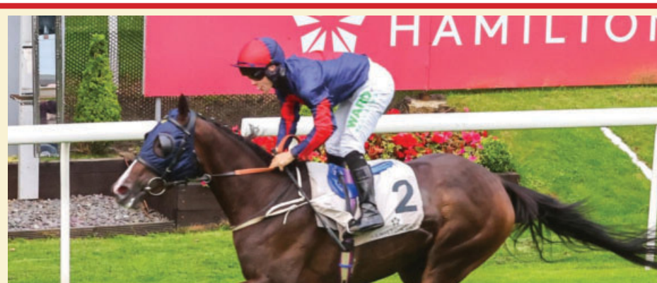
Johnston Racing enjoyed a special evening at Hamilton Park on August 14 when Dreams Adozen, Love De Vega and Ask Peter provided an exciting treble.

A decent treble for the stable then, achieved at odds of just under 180/1, with our three winners all ridden by different jockeys! ■