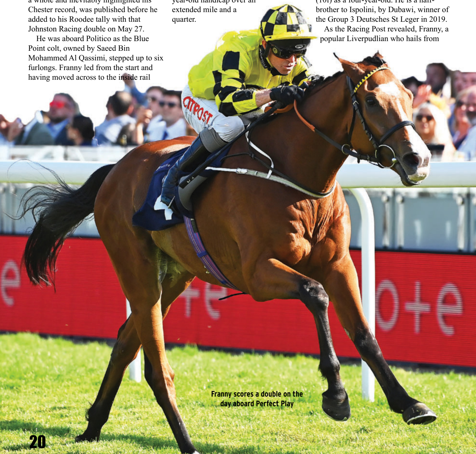
Franny scores a double on the day aboard Perfect Play

As the Racing Post revealed, Franny, a popular Liverpoolian who hails from