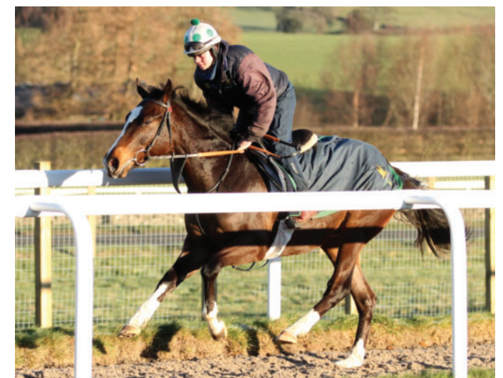
KP 34-Gold's Highland Reel colt out of Recambe