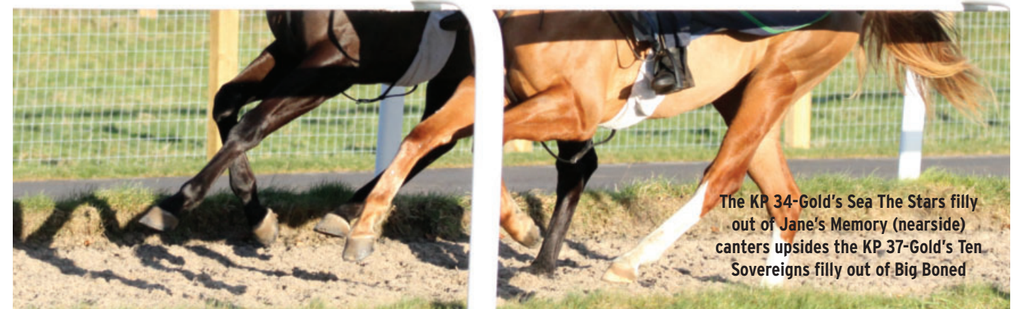
The KP 34-Gold's Sea The Stars filly out of Jane's Memory (nearside) canters upsides the KP 37-Gold's Ten Sovereigns filly out of Big Boned