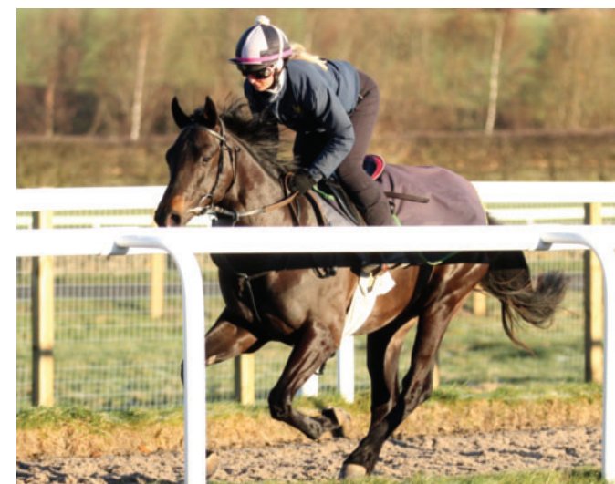
KP 37-Gold's Wootton Bassett colt out of Victoria College