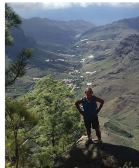
Perched above the Tsarte Baranco, Gran Canaria

What is your favourite sport outside racing? Cycling